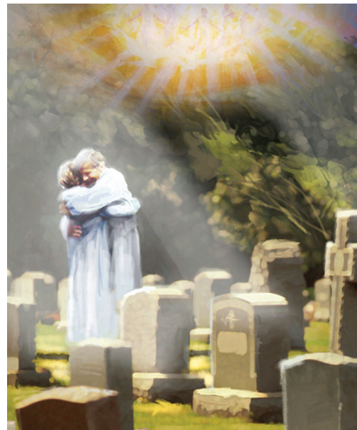
At the Second Coming, the dead in Christ are raised to immortal life, and those who hate Him are slain.