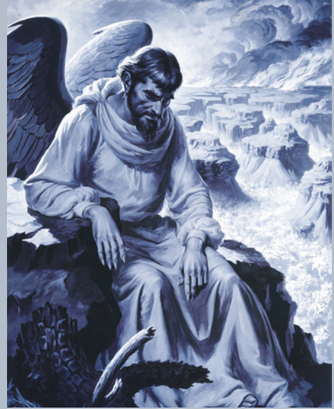
Satan is forced to remain on a desolate earth with no one to tempt for 1000 years.

Let's outline, in chronological order, what transpires prior to, during and after this millennium: